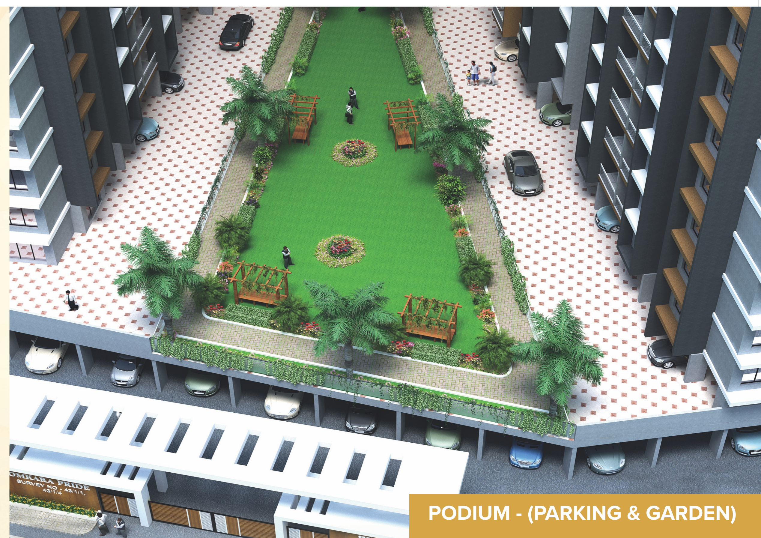
PODIUM - (PARKING & GARDEN)