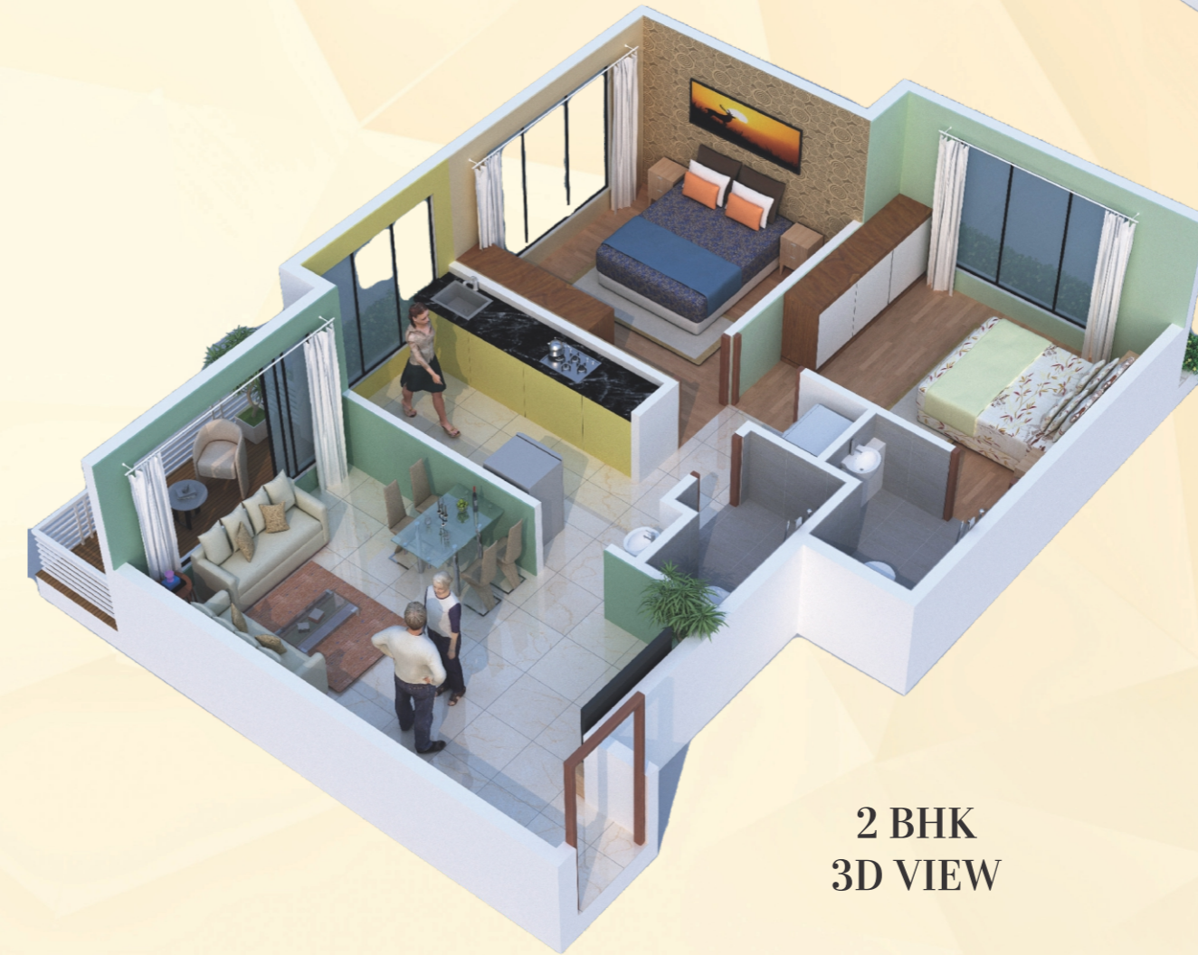
2 BHK 3D VIEW