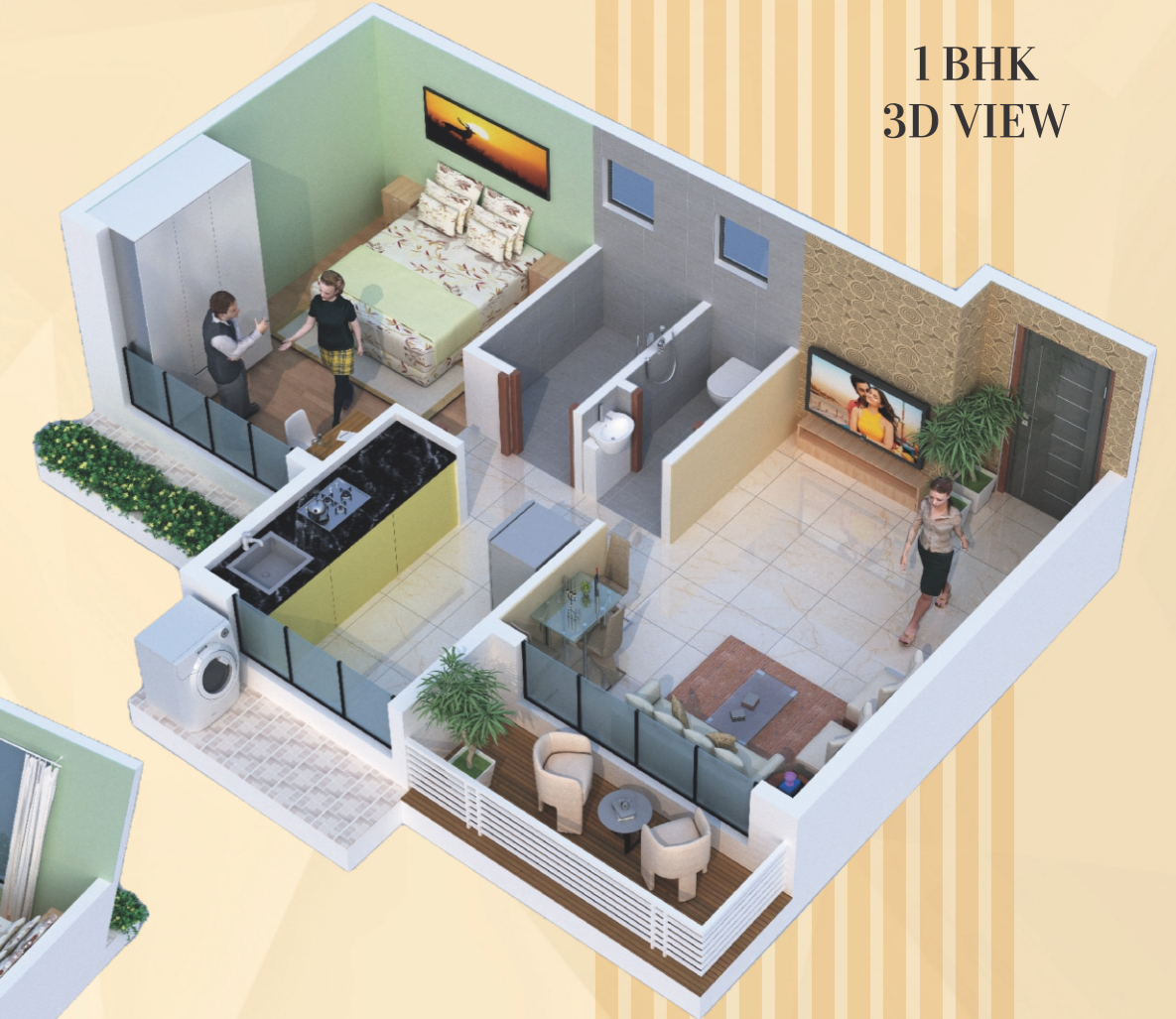
1 BHK 3D VIEW