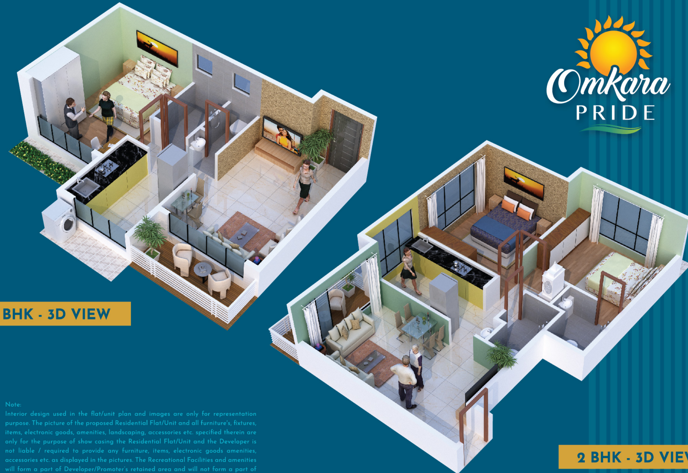
1 BHK - 3D VIEW