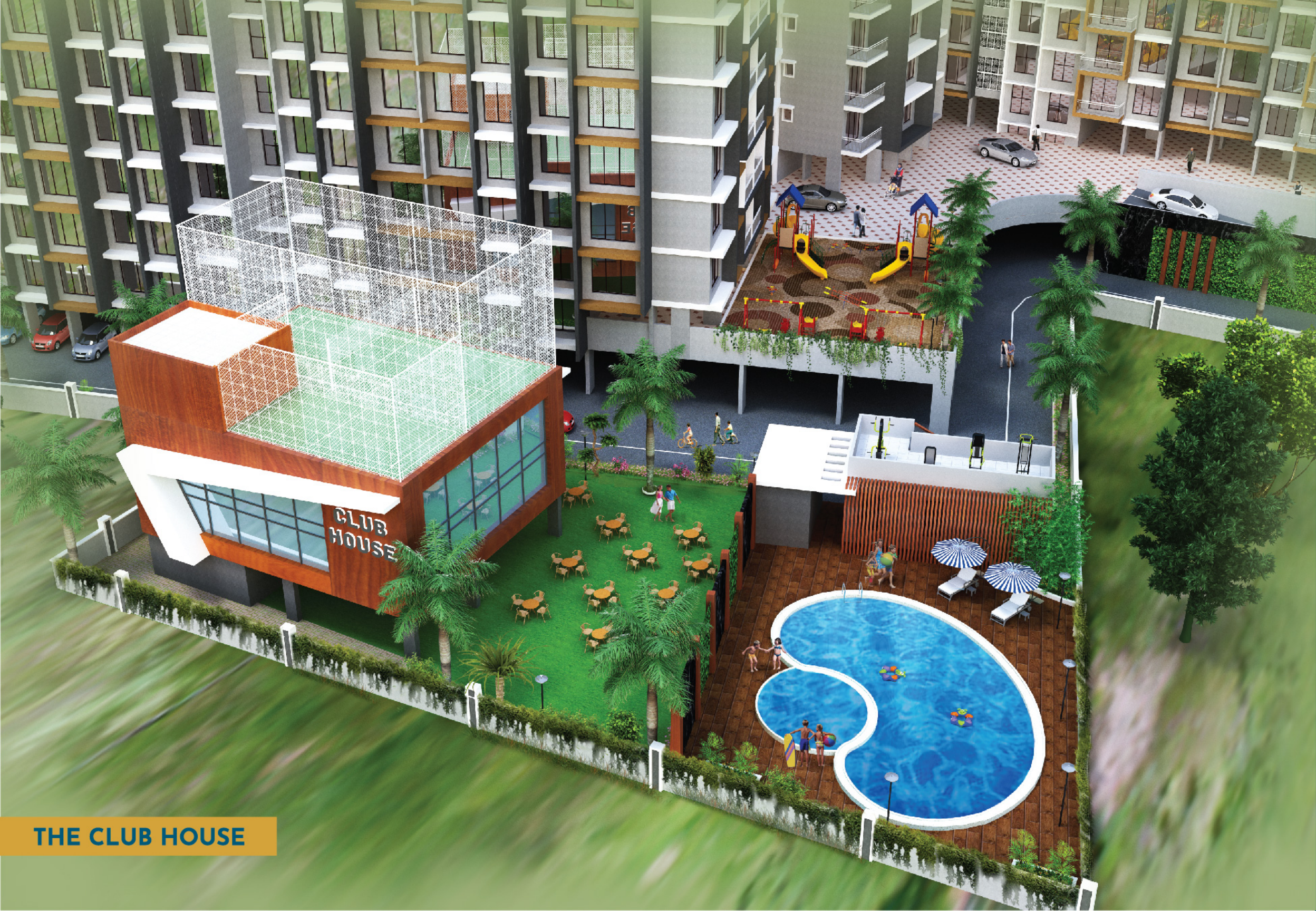
THE CLUB HOUSE